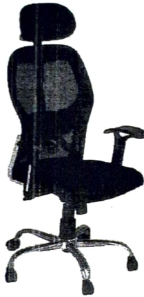
Revolving Office Chair